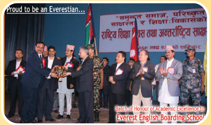
Batch of Honour of Academic Excellence to Everest English Boarding School