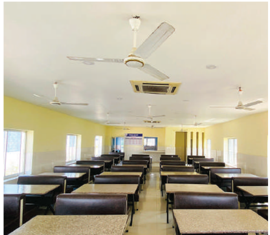
CAFETERIA WITH SPACIOUS AREA AND HEALTHY FOOD